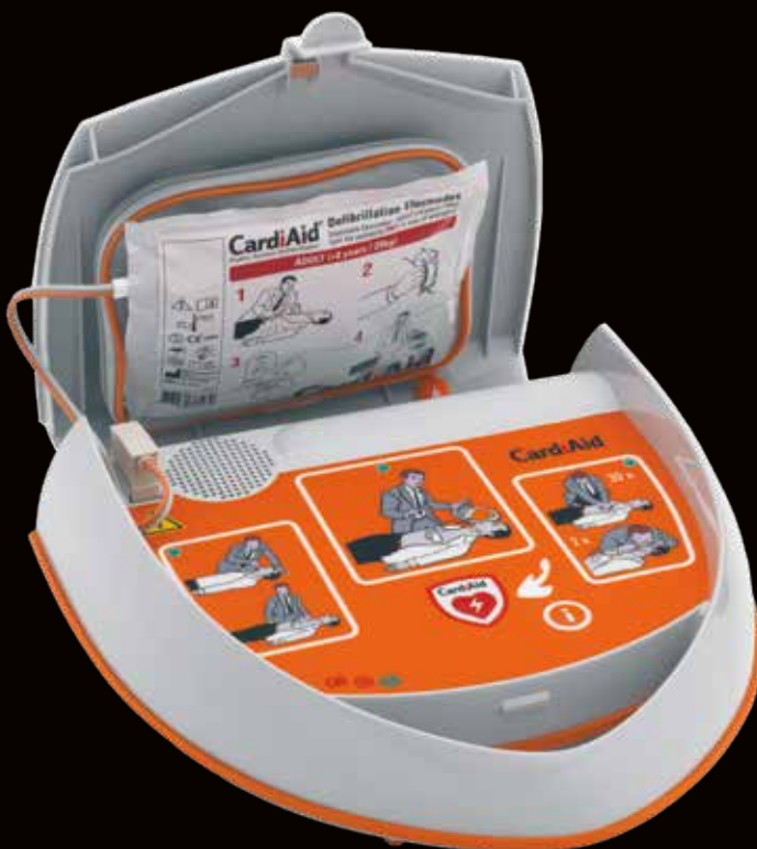
Public Access Defibrillator